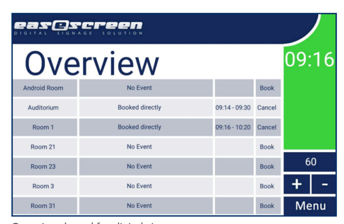
Overview-board for digital signage