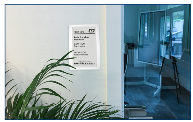
elnk: passive display of room booking information